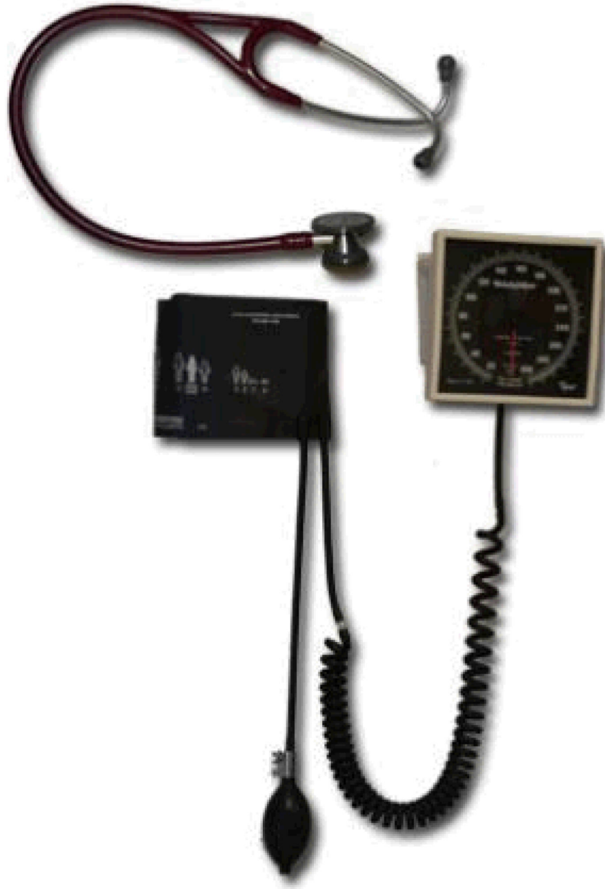
Figure 1. Equipment used in blood pressure measurement

The essential equipment for blood pressure measurement includes a stethoscope and a sphygmomanometer. The stethoscope should have tubing of sufficient length to allow auscultation of Korotkoff sounds while viewing the manometer at eye level. The sphygmomanometer includes a blood pressure cuff with a distensible bladder, tubing connected to the cuff and a rubber bulb with an adjustable valve for coordinating inflation and deflation, and a manometer to display the pressure level in the cuff.